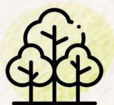
Landscaped Plots with Herbs & Fruit-bearing Trees

To ensure that your time in Vrundha Valley is as relaxing as possible, we've built a state-of-the-art infrastructure. Quality and long-term viability are at the heart of all we do.