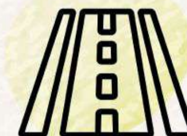
Well-paved Road Network