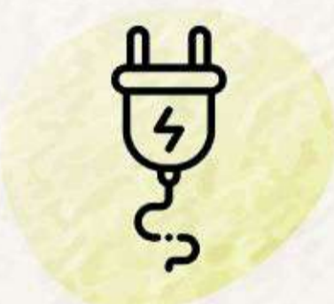
Underground Electricity & Communication System