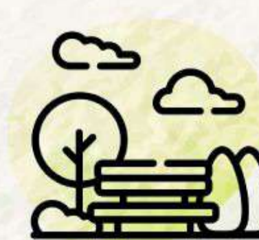
Landscaped Gardens with Seating Areas