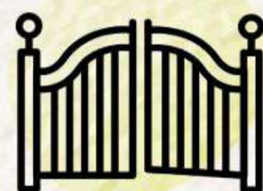
Paved Plot Entry