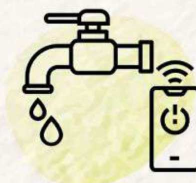
Efficient Gravity Flow Water Network System