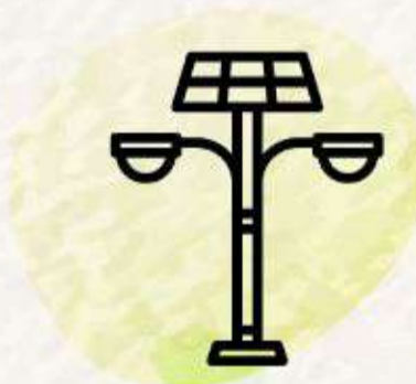
Energy-efficient Street Lights