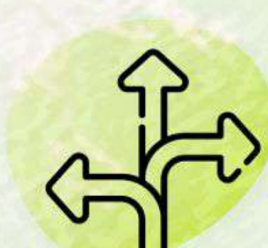
Directional & Safety Signages