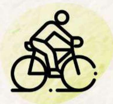
Dedicated Cycle & Pedestrian Infrastructure